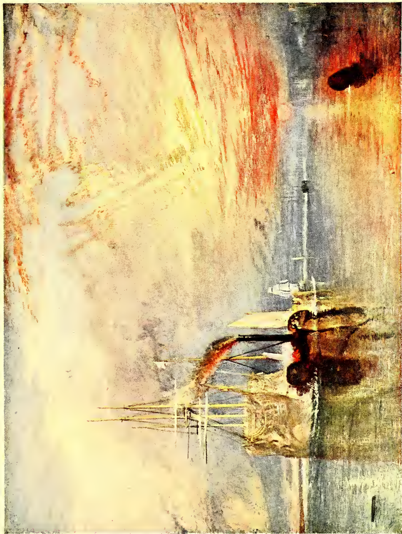
THE FIGHTING TÊMÉRAIRE.

From the picture by Turner, in the National Gallery, London.